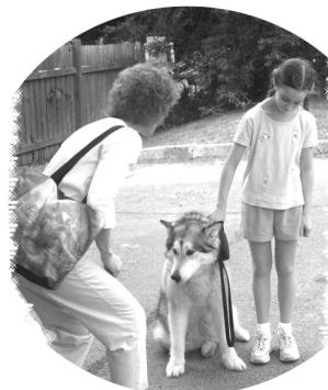
Teach & support your child!

Being a responsible Malamute owner does not mean being the loudest, biggest, or the most threatening. Indeed, many Mals have been the victim of outdated and barbaric training advice (e.g., forced “flip & rollovers”) leaving the new dog frightened, confused, and unable to trust or readily bond with those in his or her new home. This is neither leadership nor how to teach kids to behave respectfully towards a Malamute that is, or soon will be, 80lbs or more!